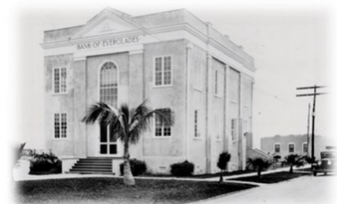
Photos: Top, Kelly Roofing on the job! Bottom: Bank Building circa 1927.

We are also reaching out to the community to see if twenty-two businesses would like to join the challenge for our window project. We plan to replicate the original 4' x 8' casement windows which will also be hurricane proof. The cost of each window is $3,400 which includes installation. There are 22 windows, 8 on each side, 4 in the front and 2 in the back. Businesses will be able to choose (first come, first serve) the window they would like to sponsor, and the name of the business will be placed on a plaque under the window. For more information about the Bank of Everglades project, visit our project website www.saveboe.com or call Patty Huff at 239-719-0020. Thank you for all your help!