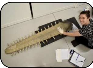
Photo of large tooth sawfish

Tax-deductible donations to help us continue our mission to promote the sustainable use and conservation of marine resources through research, outreach, and education can be made at https://havenworth.wedid.it/