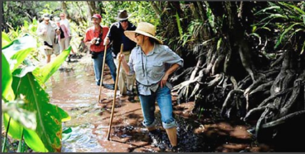
Behind Big Cypress Gallery