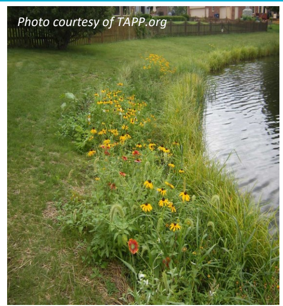
Buffers around ponds protect ponds from polluted runoff