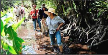
Behind Big Cypress Gallery