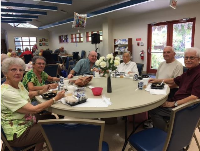
Enjoying meals and conversation at the Golden Gate Senior Center

Collier County's Senior Nutrition Program serves lunch 5 days per week to seniors ages 60 and older. Locations across Collier include: The Golden Gate Senior Center, East Naples Community Park, Goodlette Arms and The Roberts Center in Immokalee. Additionally M-F, a continental breakfast is served in Immokalee. Approximately 665 meals are served per week across Collier County.