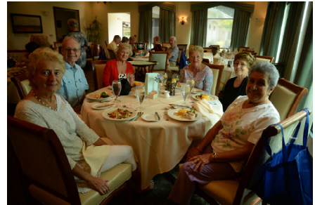
Volunteers enjoying the luncheon