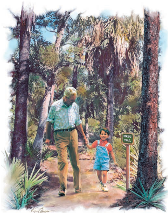
Keep children within sight and close to you, especially outdoors between dusk and dawn.

This brochure contains some guidelines to help you live safely in Florida panther country.