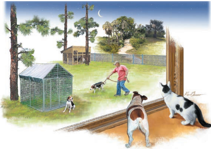
Keep your pets safe and secure. Bring pets inside or keep them in a secure and covered kennel at night.

Free-roaming pets, or pets that are tethered and unfenced, are easy prey for predators, including panthers. Bring pets inside or keep them in a secure and covered kennel at night. Feeding pets outside also may attract raccoons and other panther prey; do not leave uneaten pet food available to wildlife.