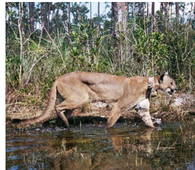
FWC Panther team

This brochure was produced through a partnership of the Audubon Society of Florida, Conservancy of Southwest Florida, Defenders of Wildlife, Florida Fish and Wildlife Conservation Commission, Florida Wildlife Federation, Friends of the Florida Panther Refuge, Mountain Lion Foundation, National Park Service, National Wildlife Federation, Seminole Tribe of Florida, University of Florida and the U.S. Fish and Wildlife Service.