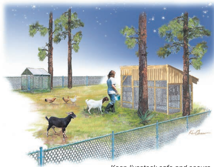
Keep livestock safe and secure.