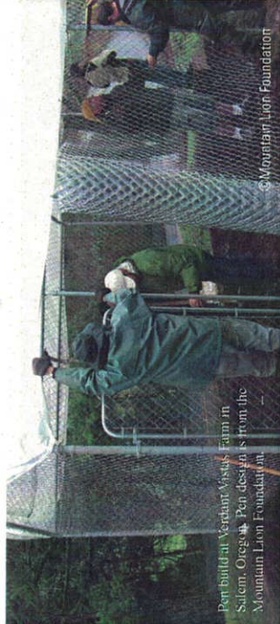
Pen build at Verdant Vistas Farm in Salem, Oregon. Pen design is from the Mountain Lion Foundation.