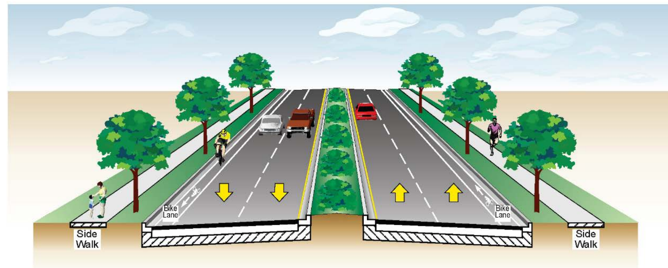
Proposed 4-Lane Urban Typical Section - Randall Blvd Alternative - Desoto Blvd Alternative - Everglades Blvd Alternative - "S" Connector Alternative