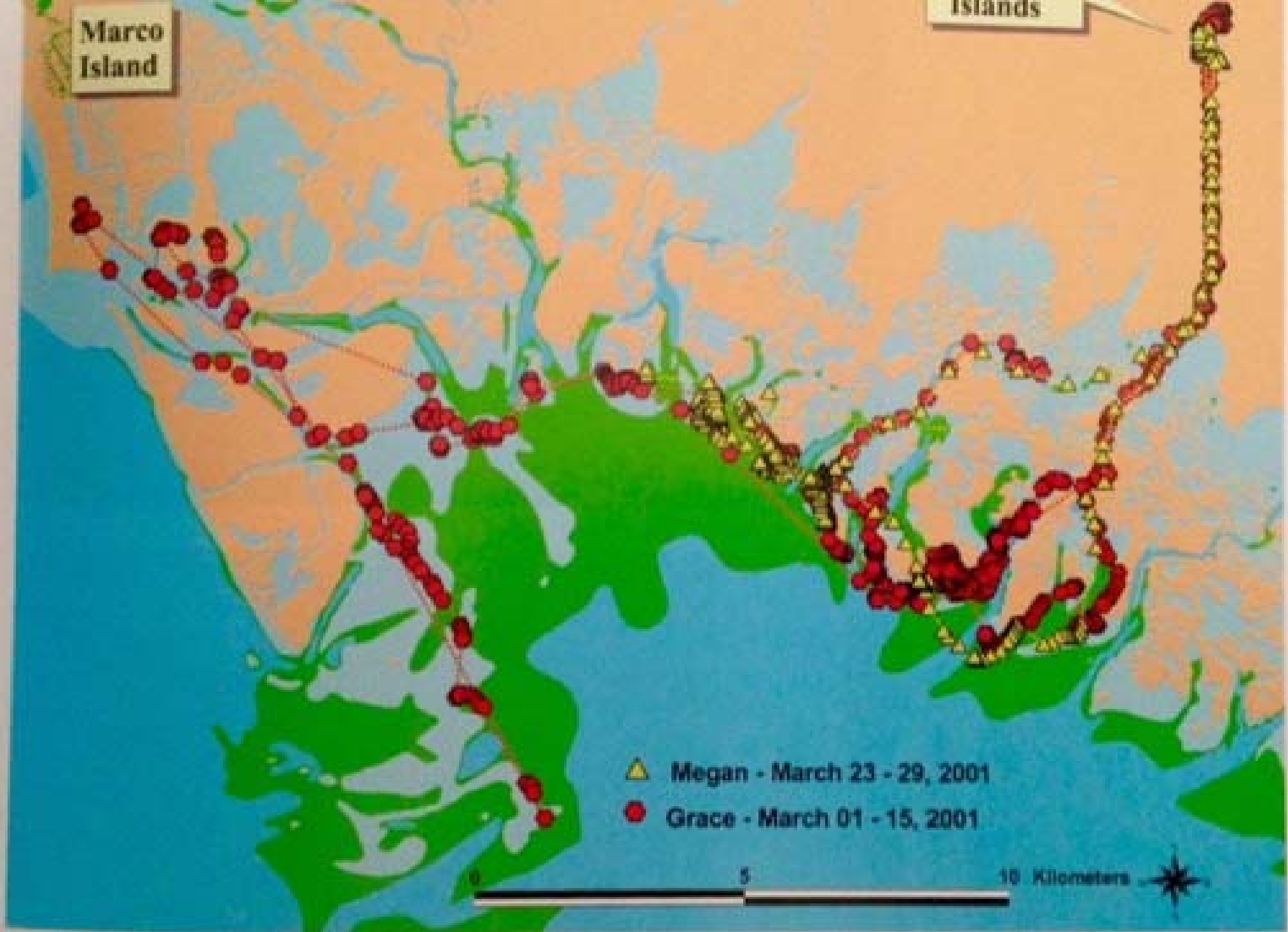
Plate 13. Detailed movements between feeding areas and freshwater sites for two manatees in the Ten Thousand Islands area of southwest Florida obtained using satellite-