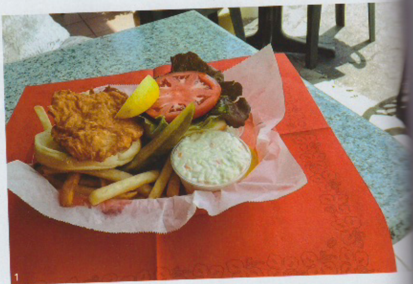
1 Leckeres bei Grouper & Chips 2 Dining al fresco im Bistro 821 3 Köstliche Combo: Donut-Burger mit Speck

Sehr empfehlenswert zum Lunch ist der »Grouper Sandwich Basket«. Natürlich stehen auch Shrimps, Hummer und Muscheln auf der Speisekarte. Neben den in Florida üblichen Gerichten wird hier aber auch eine ganz hervorragende Bouillabaisse gekocht.