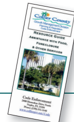
Code Enforcement assisted 2,500 homeowners with free public outreach events,