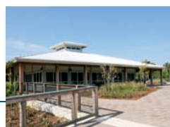
Transportation Engineering received an award for Freedom Park.