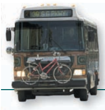
CAT implemented several route modifications.

Transportation Engineering completed construction of several segments of the Lely Area Stormwater Improvement Project (LASIP). Additional segments of LASIP, which is a stormwater facilities improvement project addressing a multitude of stormwater issues within an 11,000 acre area, are in design.