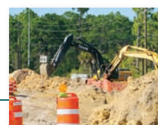
Intersection improvements are underway at Collier and Davis Boulevards.