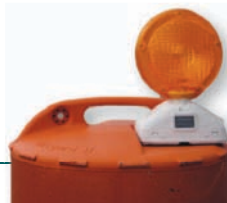
Road Maintenance resurfaced 114 lane miles.