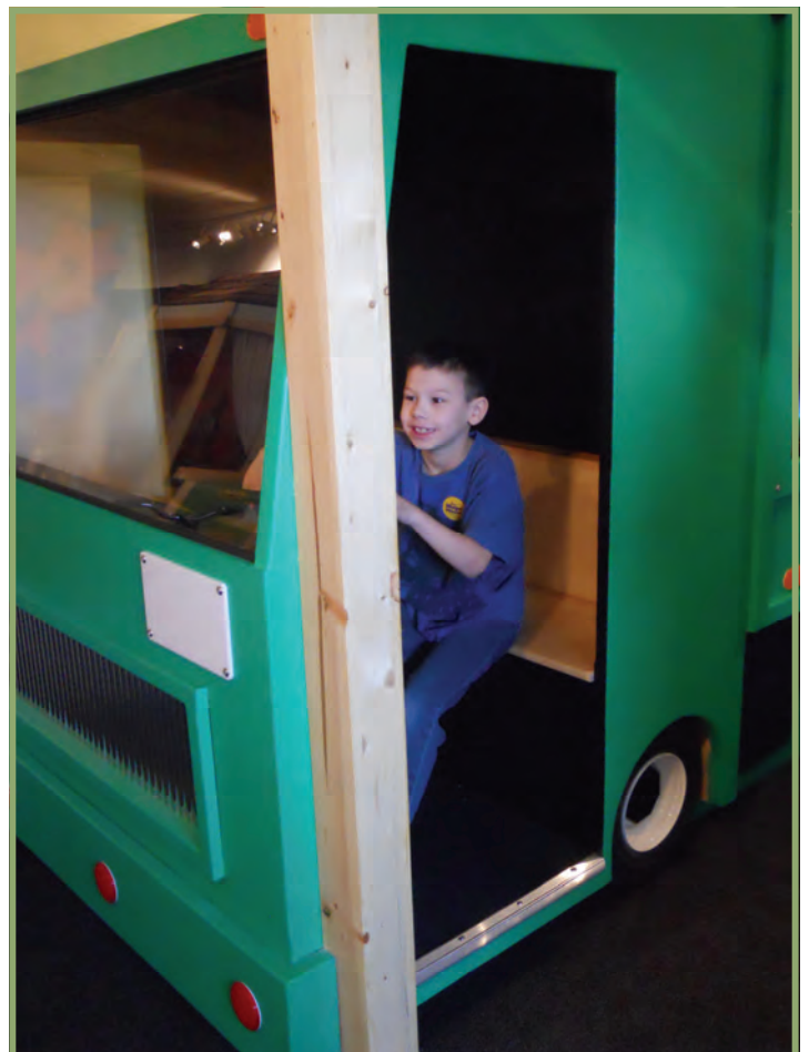
Drive a recycling truck.