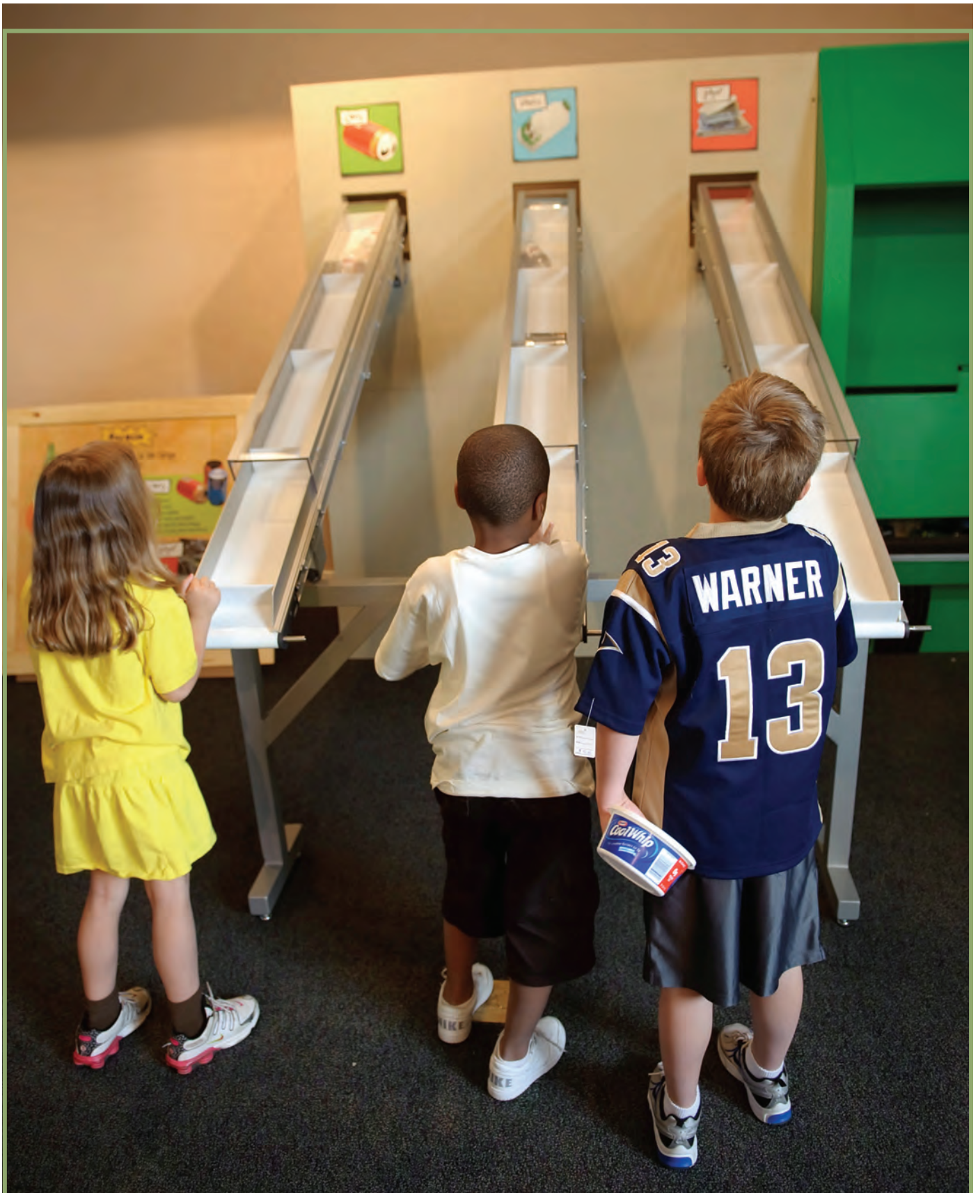
Take on the role of workers in a recycle center