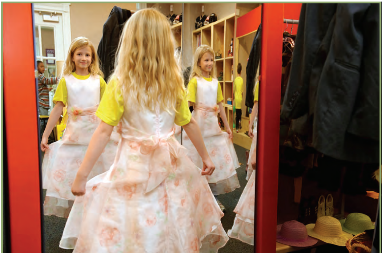
Try on funky clothes and see the result in the many mirrors