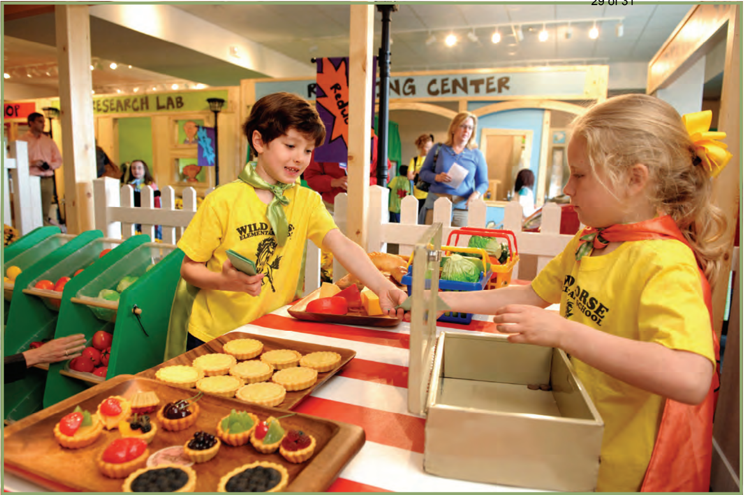
Sell fruits and vegetables in a local outdoor market.