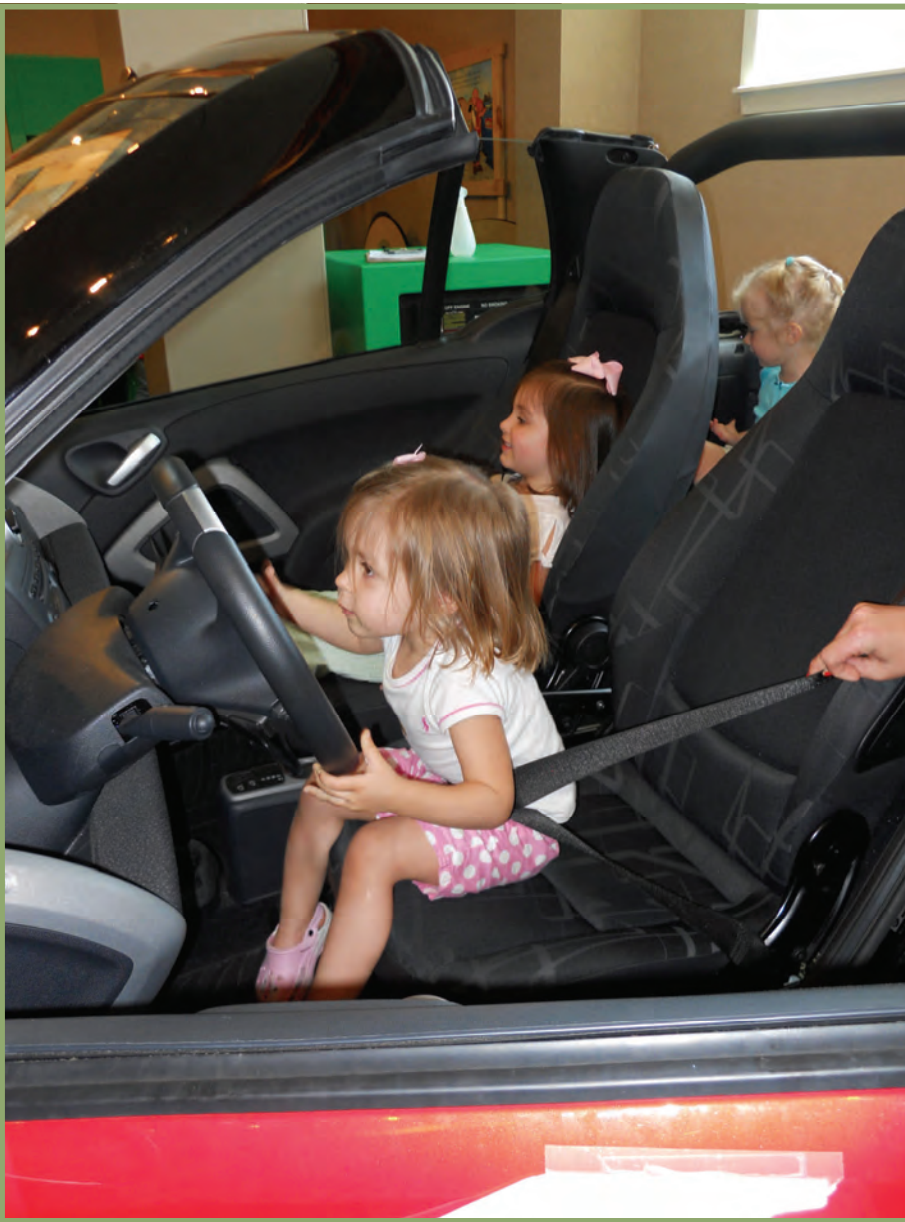
Explore the convertible Smart Car