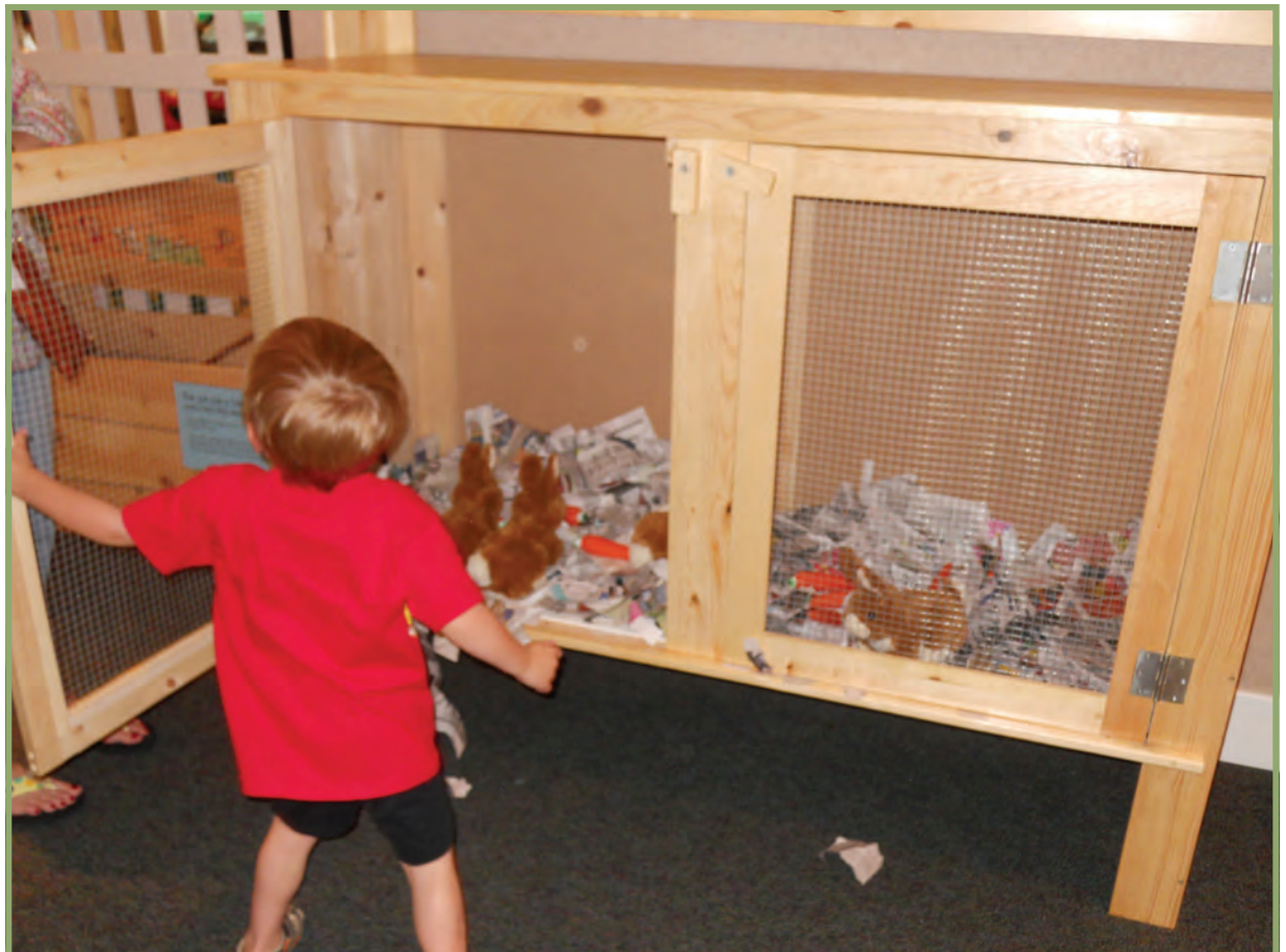
Feed the rabbits carrots from the garden