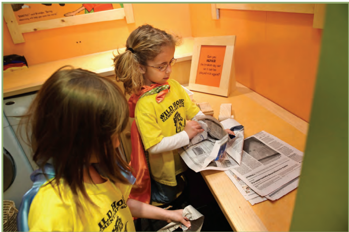
Create bedding for the bunny cage from torn newspaper.