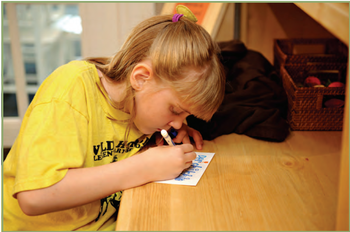
Produce greeting cards from a wide variety of recycled materials