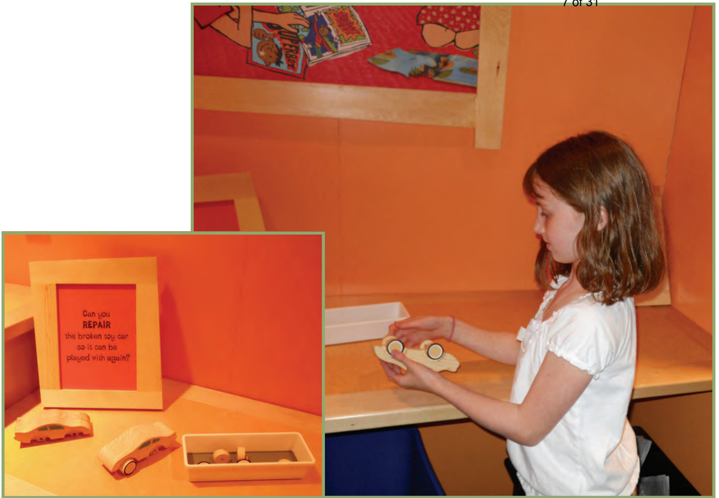
Repair a broken toy car so it can be played with again.