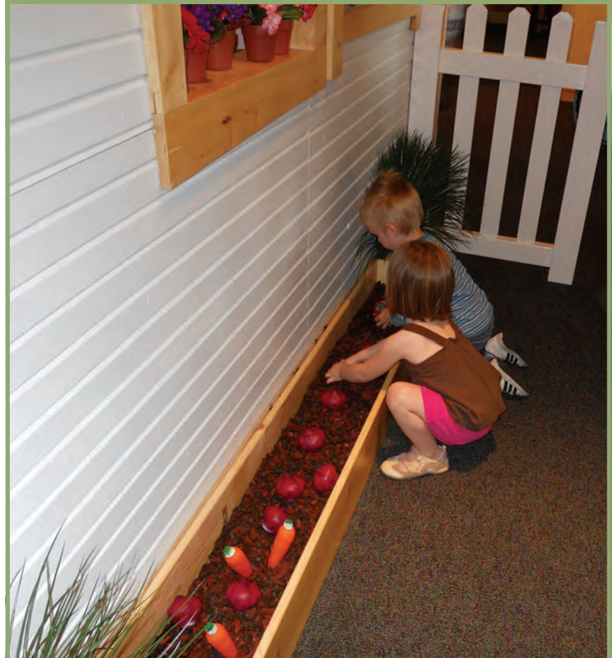
Pick fresh vegetables in the garden to take to the market.