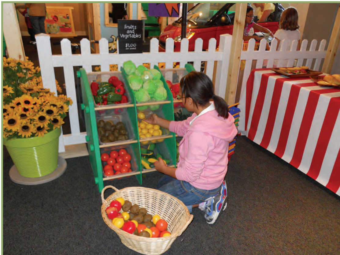
Arrange the produce in the Farmer's Market