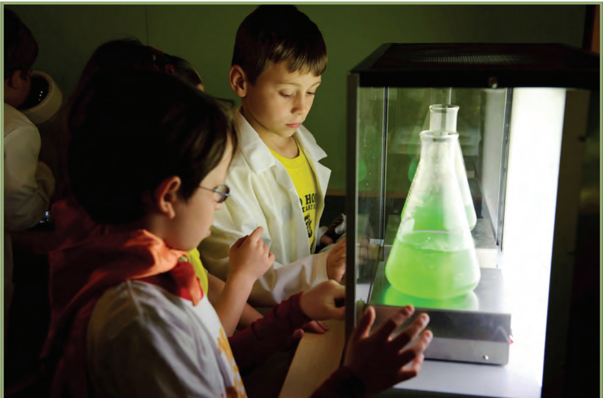
Activate a magnetic spinning mechanism to maximize the growth of algae