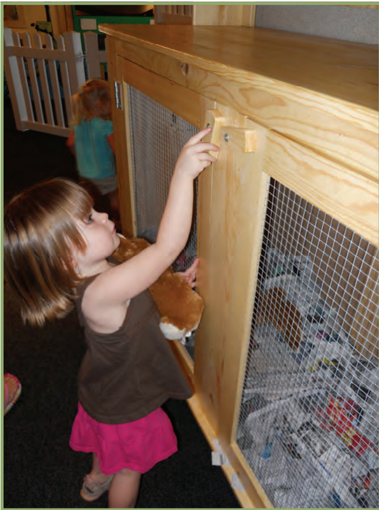
Make the rabbits comfortable with shredded paper bedding