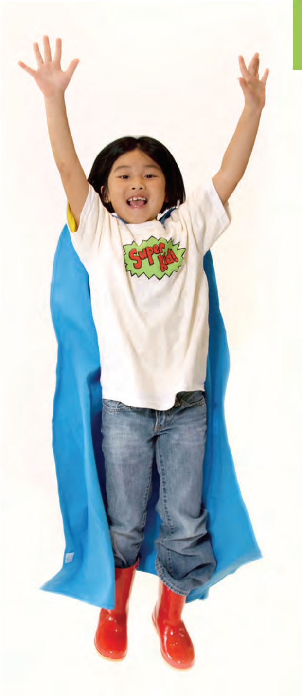
Don a Super Hero cape.

Take the Super Kid pledge to take care of our world.