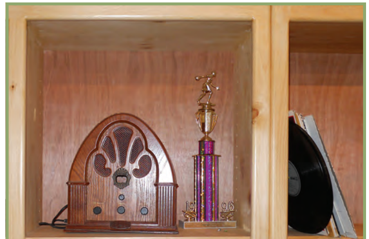
Play music on record players, radios and cassette recorders