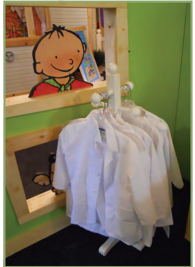
Wear a lab coat just like a real scientist