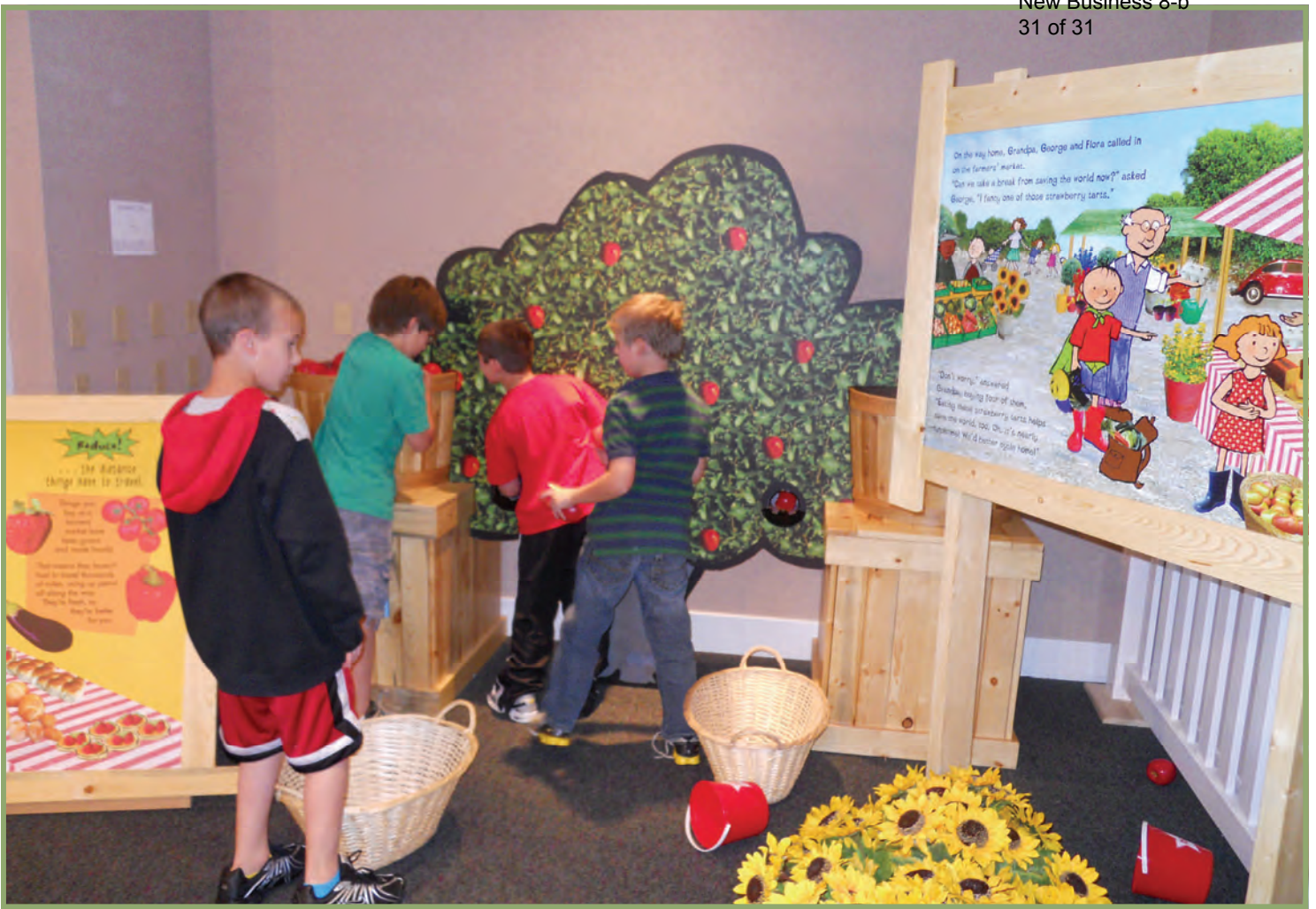
Pick apples from a special tree.