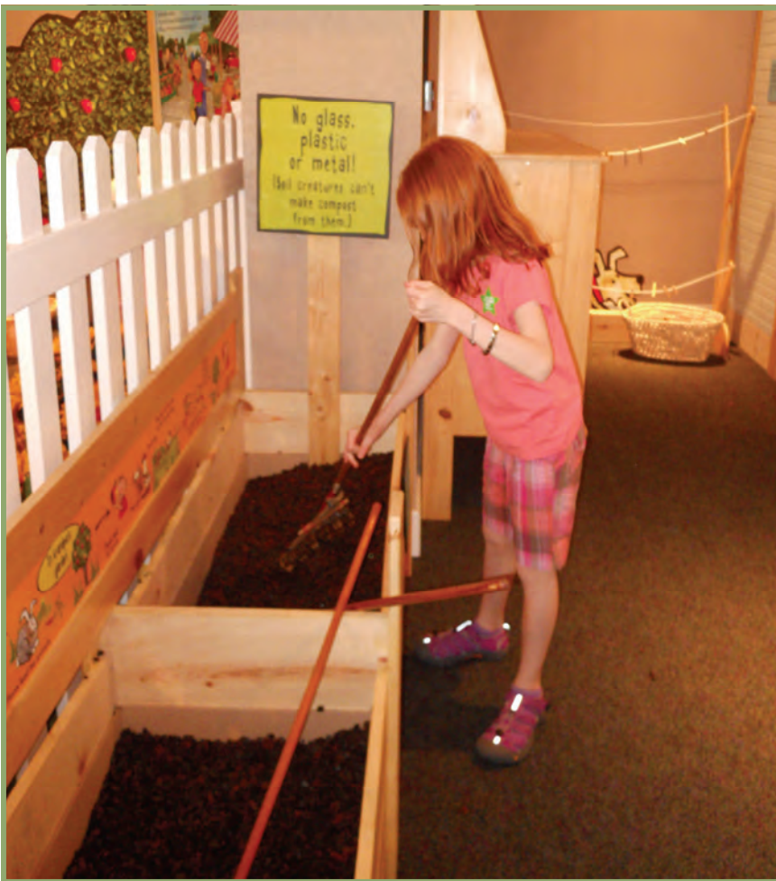
Turn the compost with a garden rake.