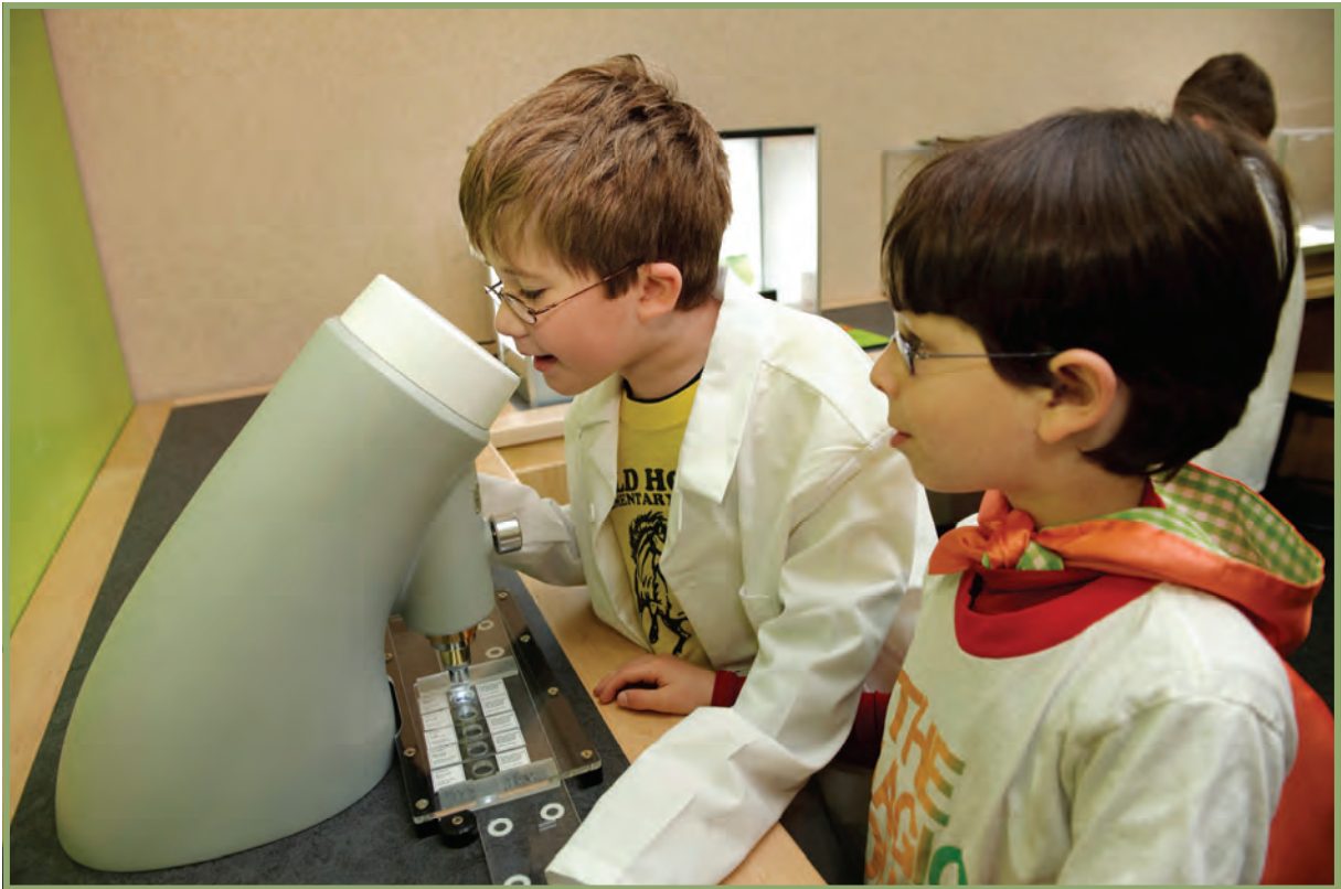
Use a microscope to identify algae from other microorganisms.