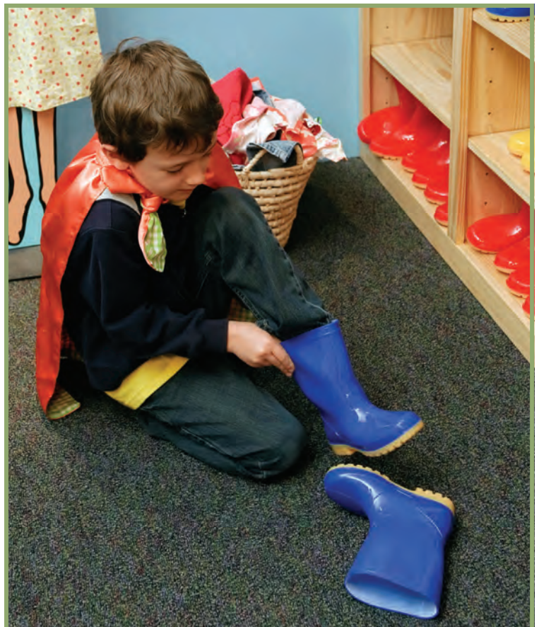
Pull on your Super Hero boots