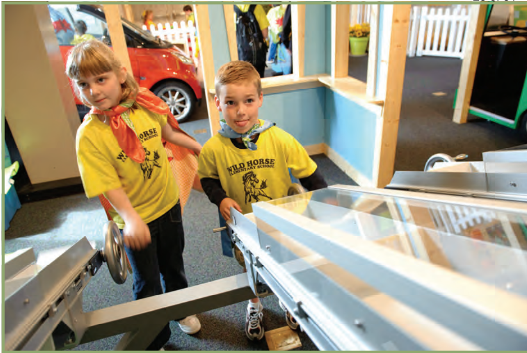
Sort trash onto a conveyor belt system