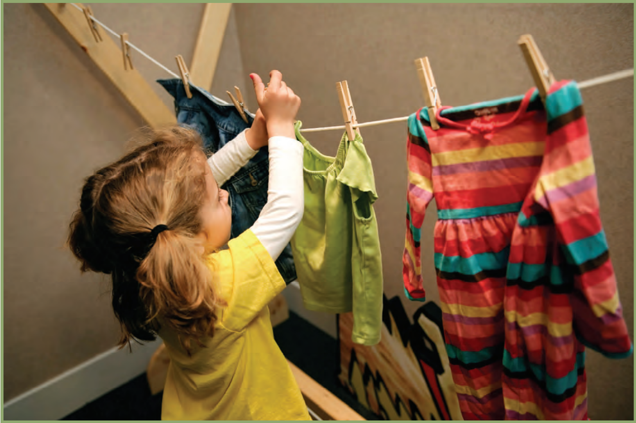
Save energy by hanging clothes on a clothesline