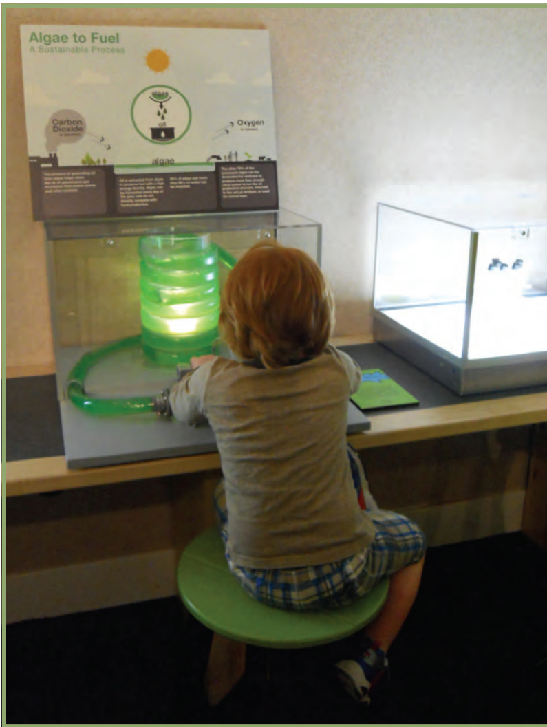
Pump algae water through a photo-reactor