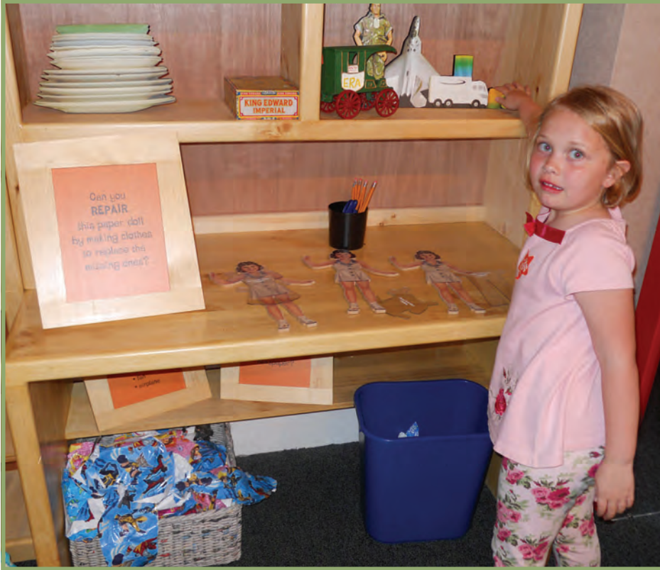
Make new clothes for a paper doll