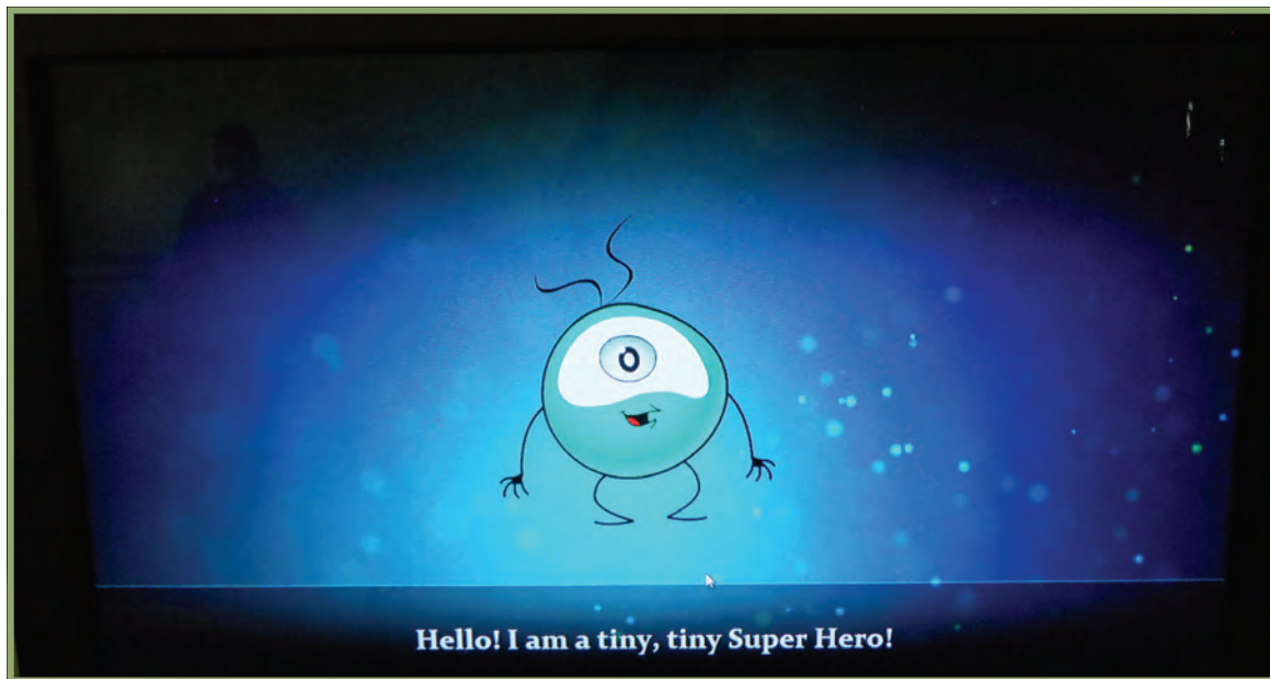
Learn about the importance of algae in bio-fuel production by playing a fun virtual algae game