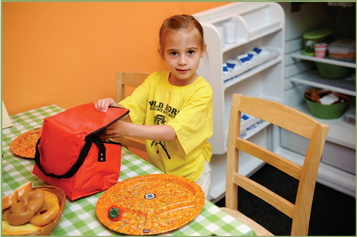
Prepare and pack a healthy lunch with re-usable containers.