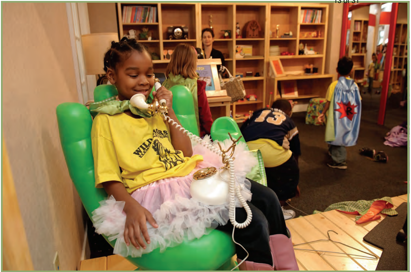
Arrange the display windows with interesting re-used items