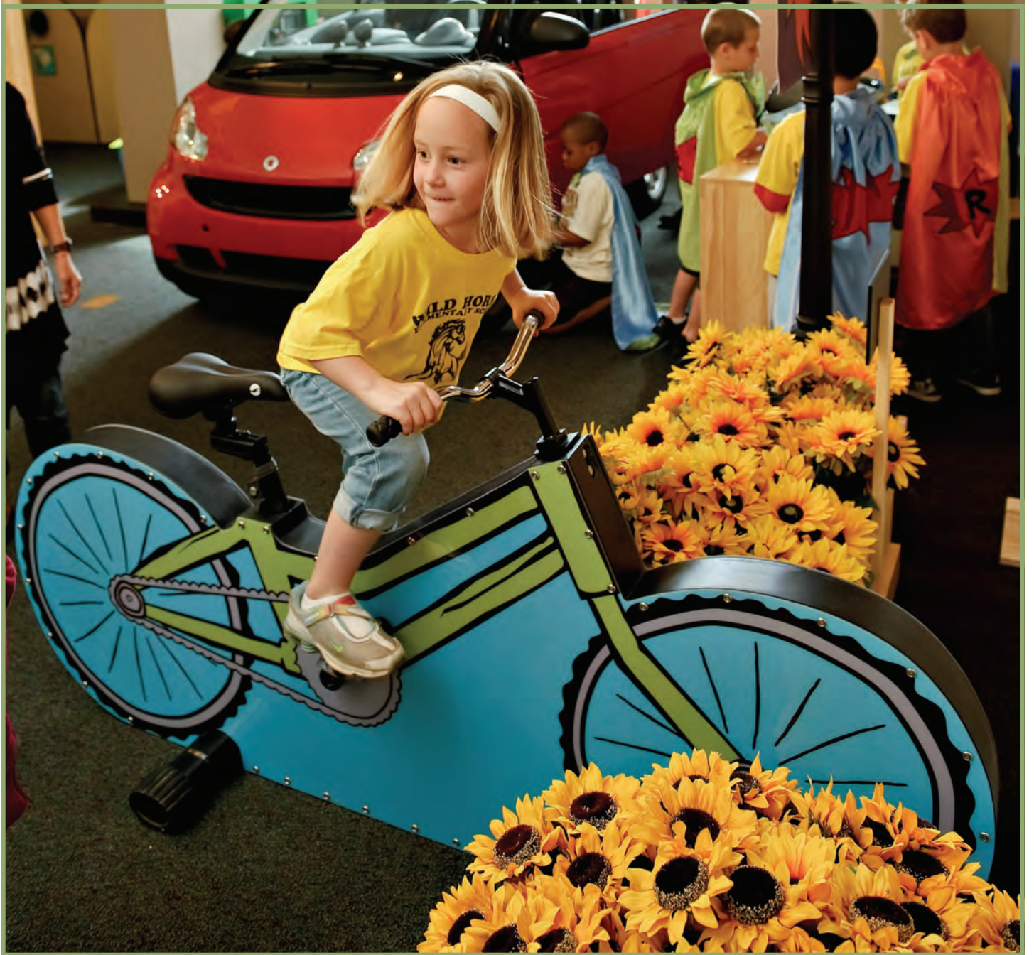
Ride a bike to generate energy to power a streetlight.