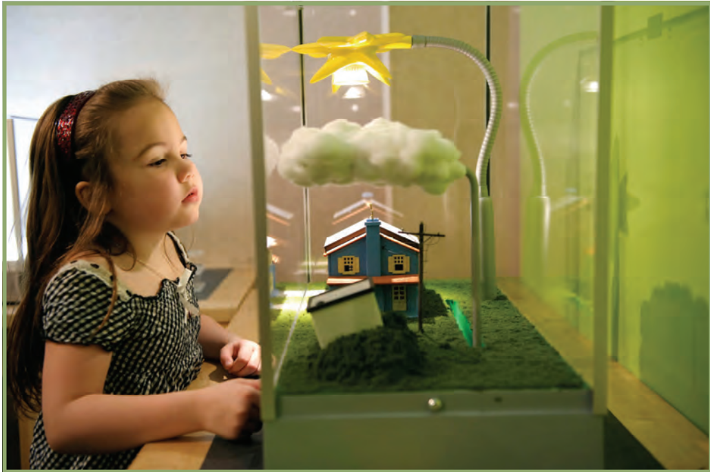
Operate the levers to learn about solar power.