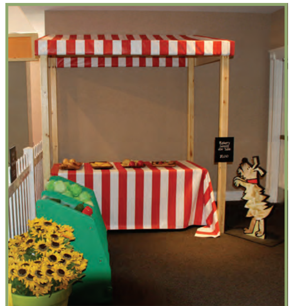
Arrange baked goods, cheese and bread for sale under a colorful awning