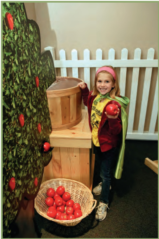
Pick apples from a special tree.