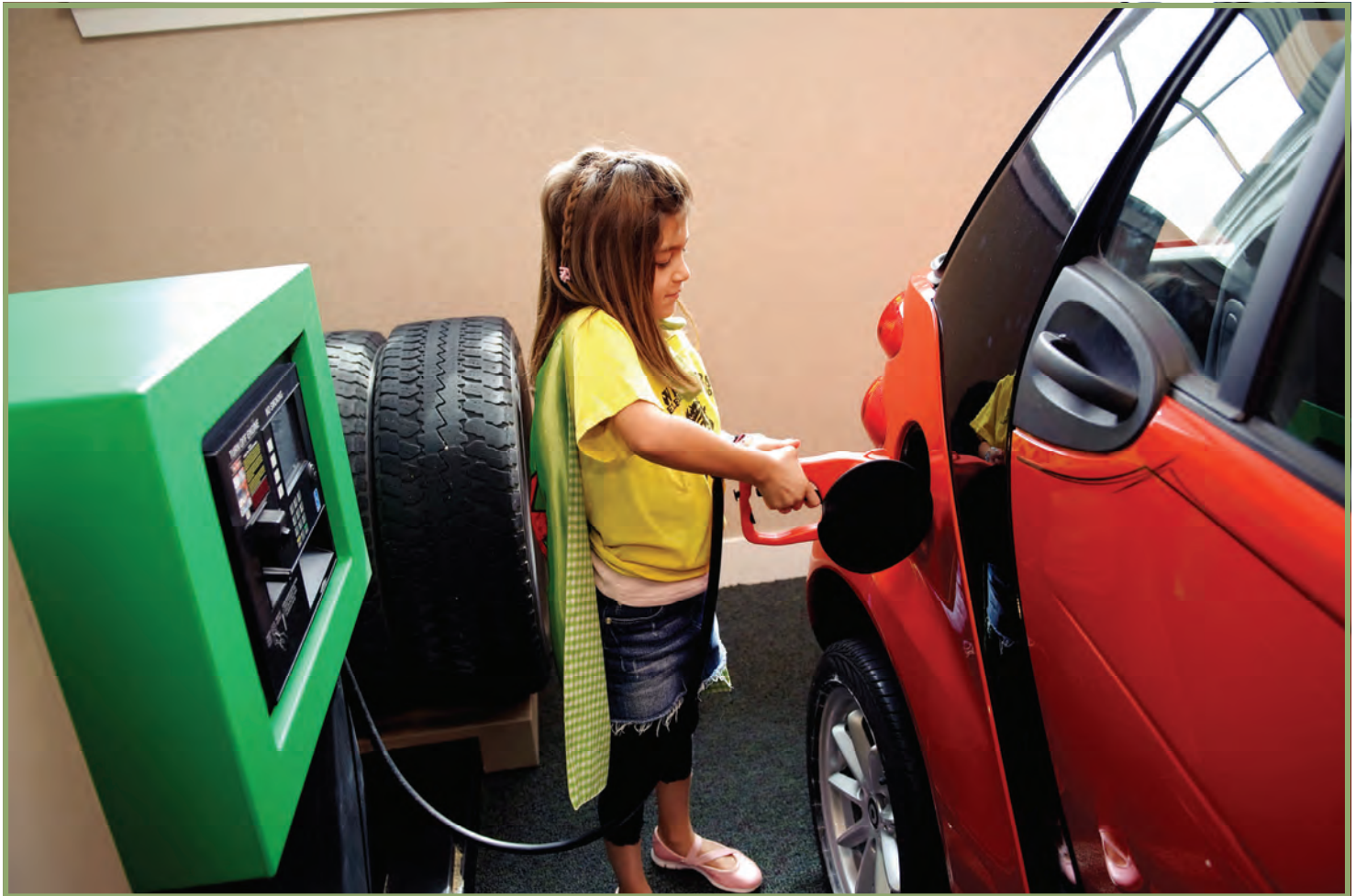
Fill the tank with biofuel