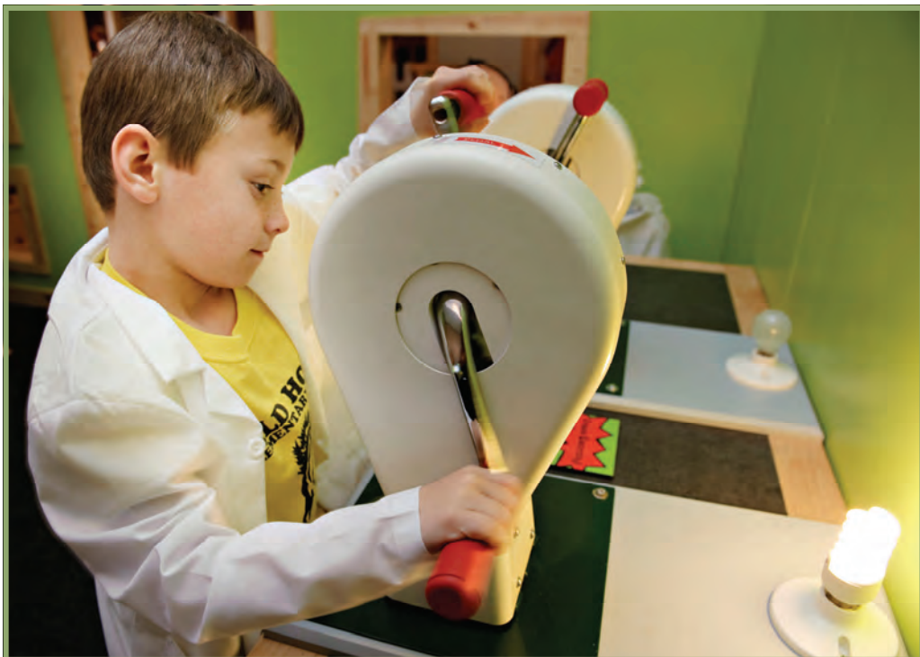
Turn a hand crank generator to experience the difference between incandescent and compact fluorescent light bulbs.