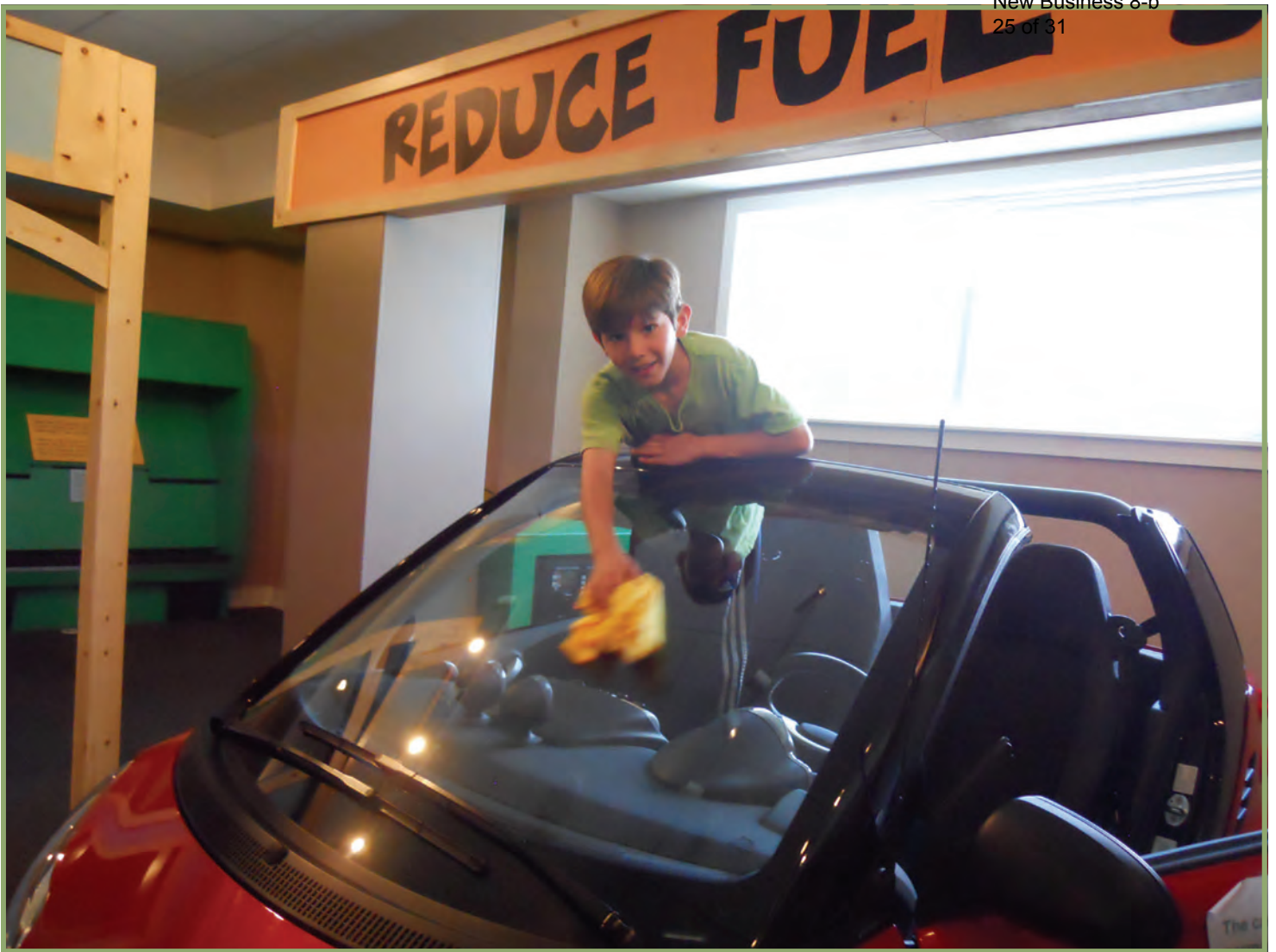
Clean the windshield with a homemade and safe cleaning product.