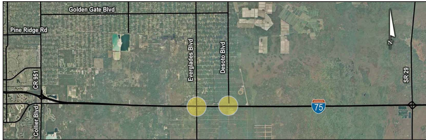
Potential Interchange Locations (circled)