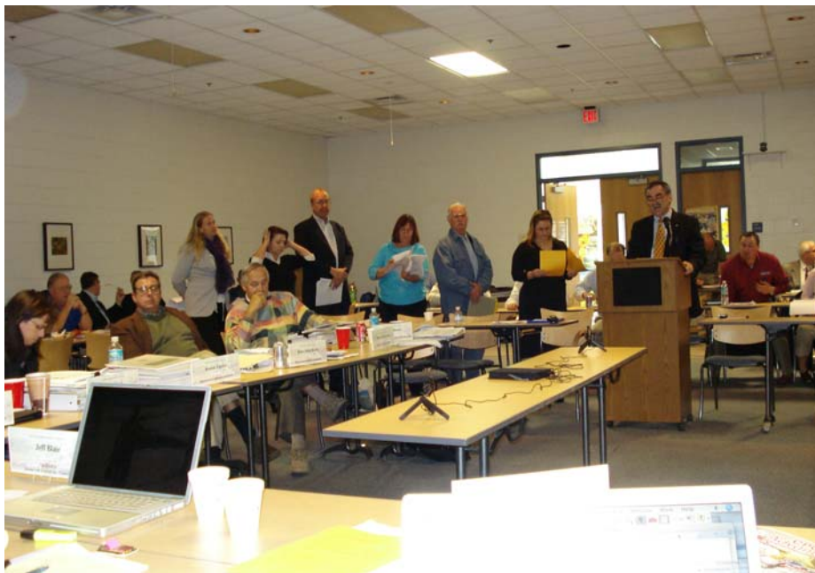
Public Comment at the December 17, 2007 Task Force Meeting, Apopka

It met for six meetings between September, 2007 and January, 2008 and received briefings and public comments at each meeting. It also established an online website to provide information on the Task Force's work and an additional opportunity for online public comment.