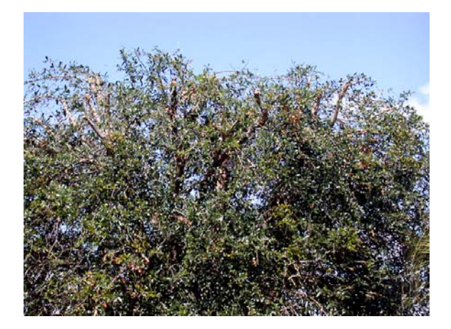
Figure 4. This tree has been topped although it isn't as blatant as some jobs, many of the stubbed branches are hidden, but some of them shine through. The use of drop-crotching or lateral pruning would avoid some of the future problems this tree will have.

Also see Pruning Landscape Trees and Shrubs, Circular 853, at: http://edis.ifas.ufl.edu/MG087.