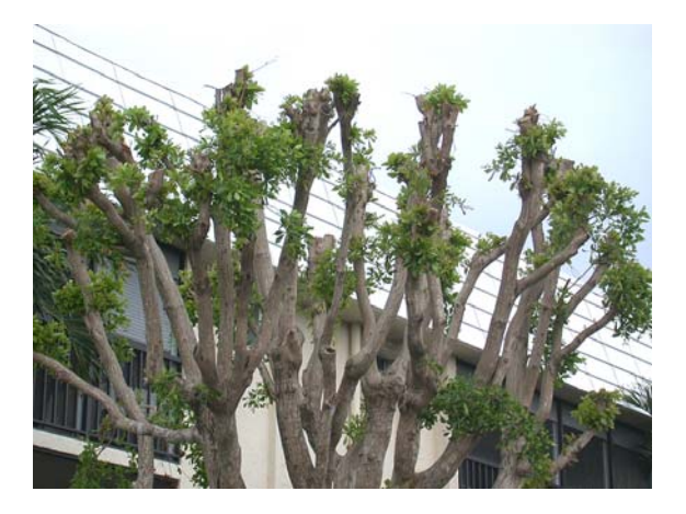
Figure 1. Before they start to work, be certain that your pruning is done by someone that will not hat-rack trees (stub cuts). This effort, on a mahogany, also flunked because there was no effort made to develop a main leader.

Growing Green • Spending Smart • Raising Families • Building Communities through Education