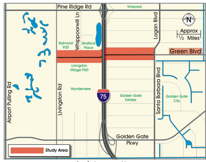
Study Location Map

Due in part to increasing congestion on Pine Ridge Road to the north and Golden Gate Parkway to the south, there is an emerging need to evaluate an extension of Green Boulevard. This congestion, coupled with the construction of a new interchange at I-75/Golden Gate Parkway and rapid growth in the Golden Gate Estates area, requires an investigation of the corridor to alleviate some of the congestion on these parallel roads. The Green Boulevard Extension is included in the 2025 Collier County Metropolitan Planning Organization (MPO) Long Range Transportation Plan (LRTP) and has been part of the LRTP since 1996. This study will also evaluate a Whipporwill Lane connection to a potential Green Boulevard Extension or Livingston Road.