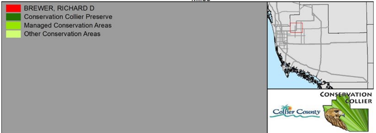
Brewer Property Location Map