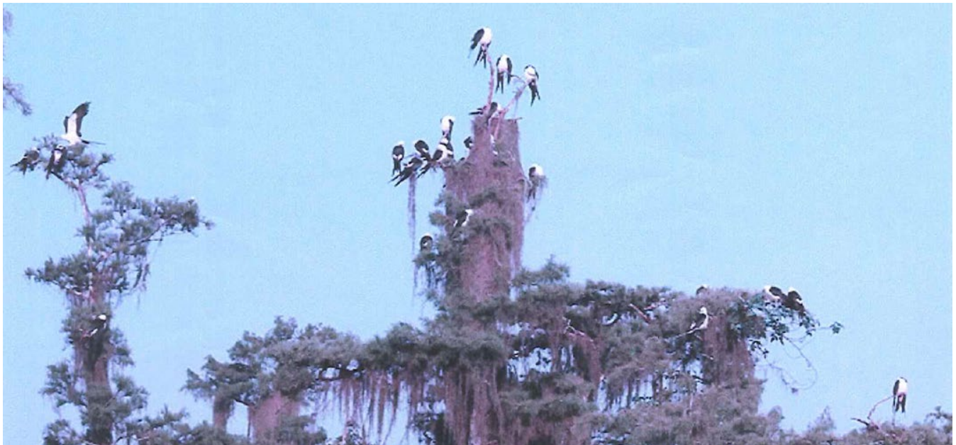
Swallow-tailed kites roosting on property July 25,2021