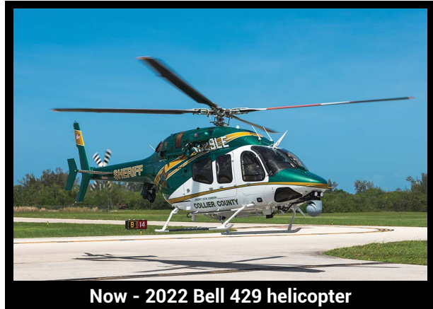
Now - 2022 Bell 429 helicopter