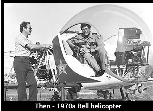
Then - 1970s Bell helicopter