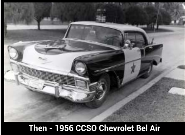
Then - 1956 CCSO Chevrolet Bel Air