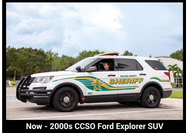
Now - 2000s CCSO Ford Explorer SUV