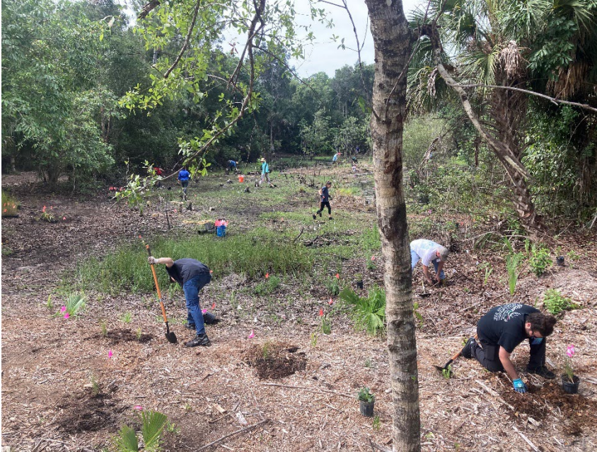
Marsh Restoration Planting at Rattlesnake Hammock Preserve

Conservation Collier Volunteer Workdays include restoration plantings of native shrubs and trees with community partners to enhance plant diversity and wildlife habitat. Two such workdays to highlight include a marsh restoration and native tree volunteer workday at the Rattlesnake Hammock Preserve thanks to community partners, neighbors and Oracle employees.