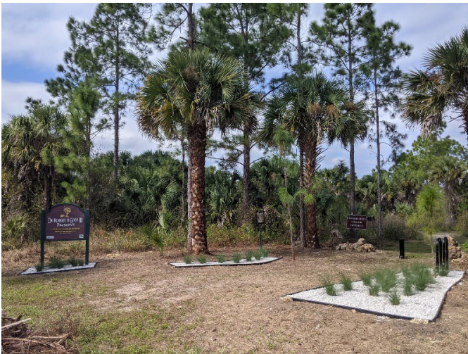
Dr. Robert H. Gore III Preserve Trailhead Beautification