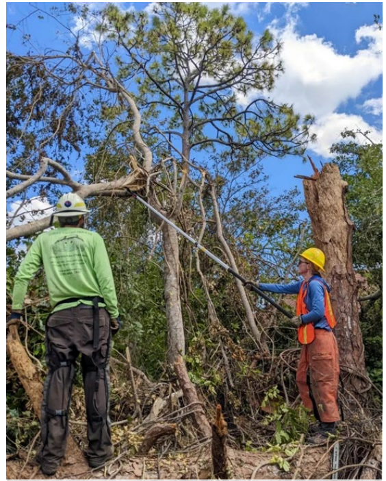
Staff conducting hurricane recovery on Conservation Collier Preserves