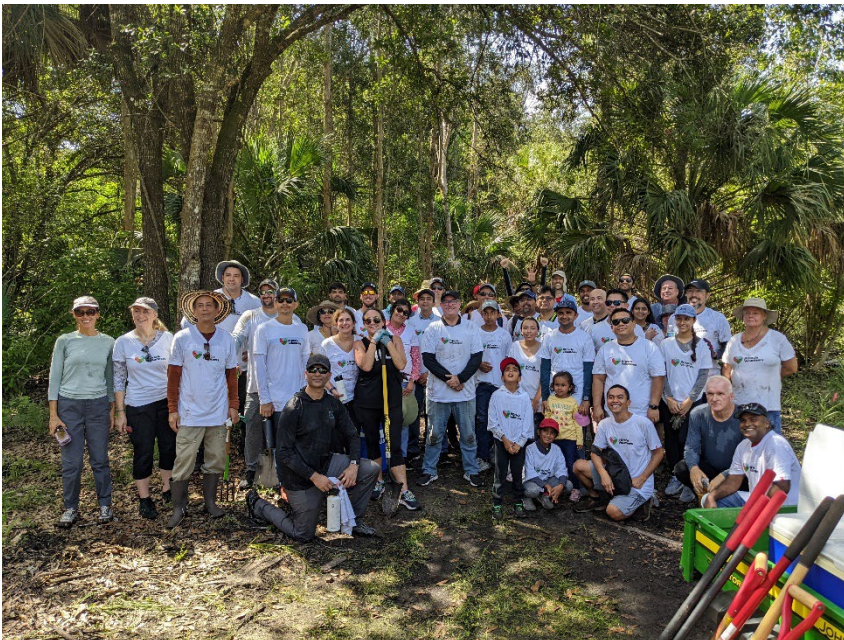
Tree Planting Workday at Rattlesnake Hammock Preserve with Oracle