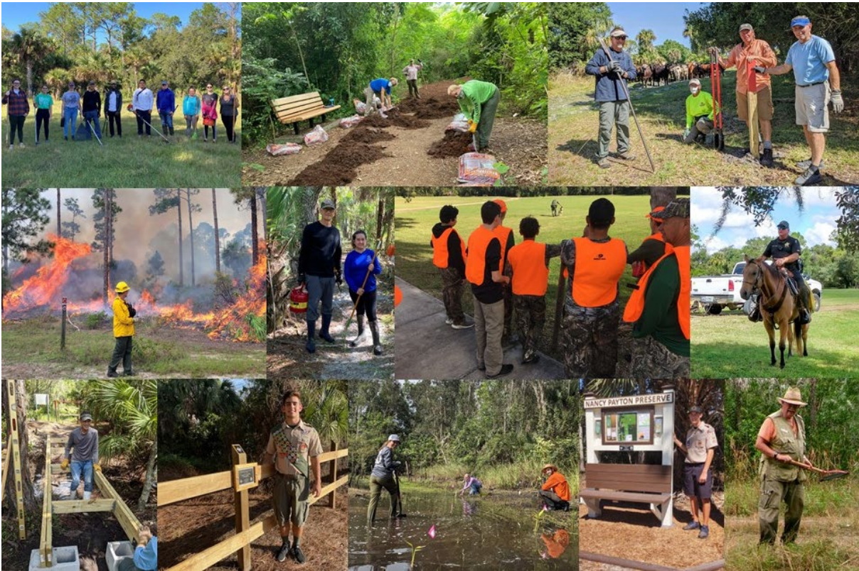
Volunteers and Partners