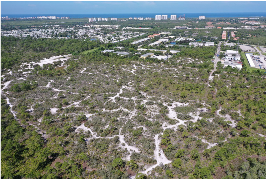
Railhead Scrub Preserve

Please accept this report on the activities of Conservation Collier calendar year 2022.