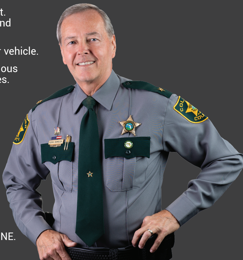
SHERIFF KEVIN RAMBOSK