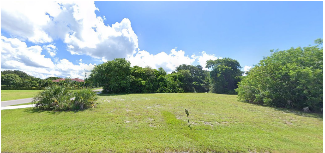
View of property looking east