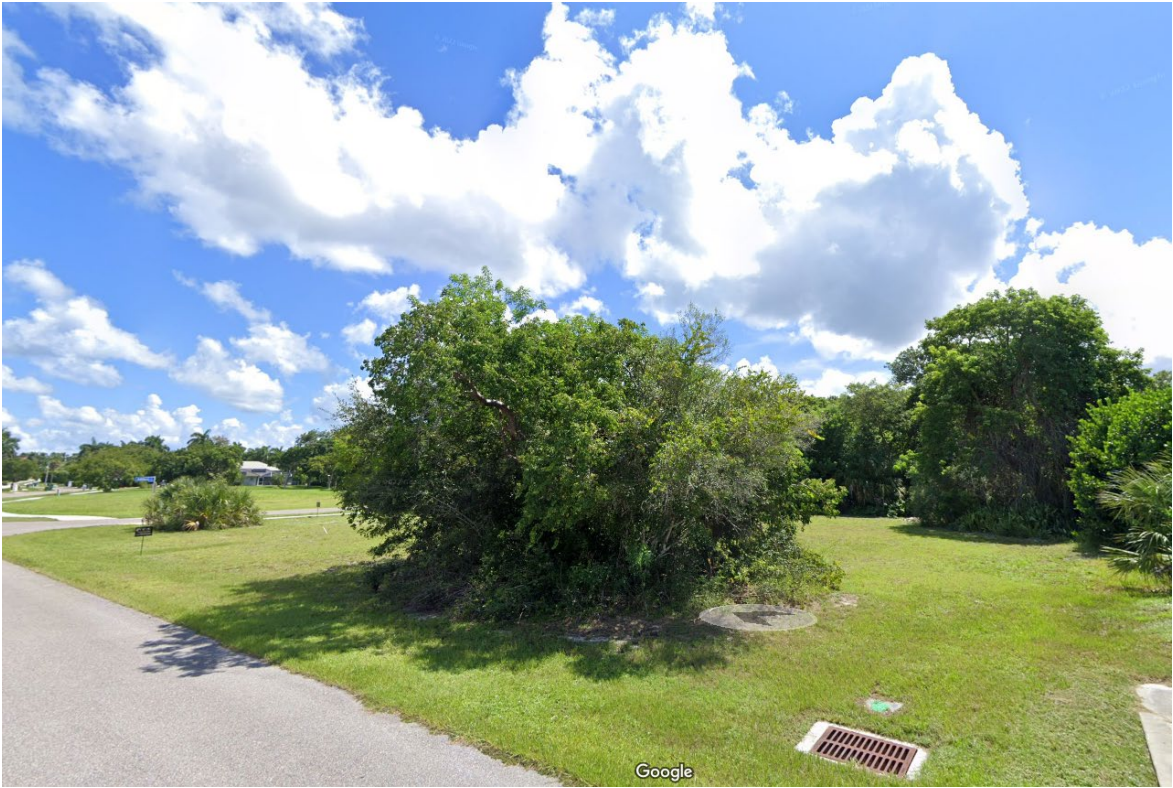
View of property looking northeast