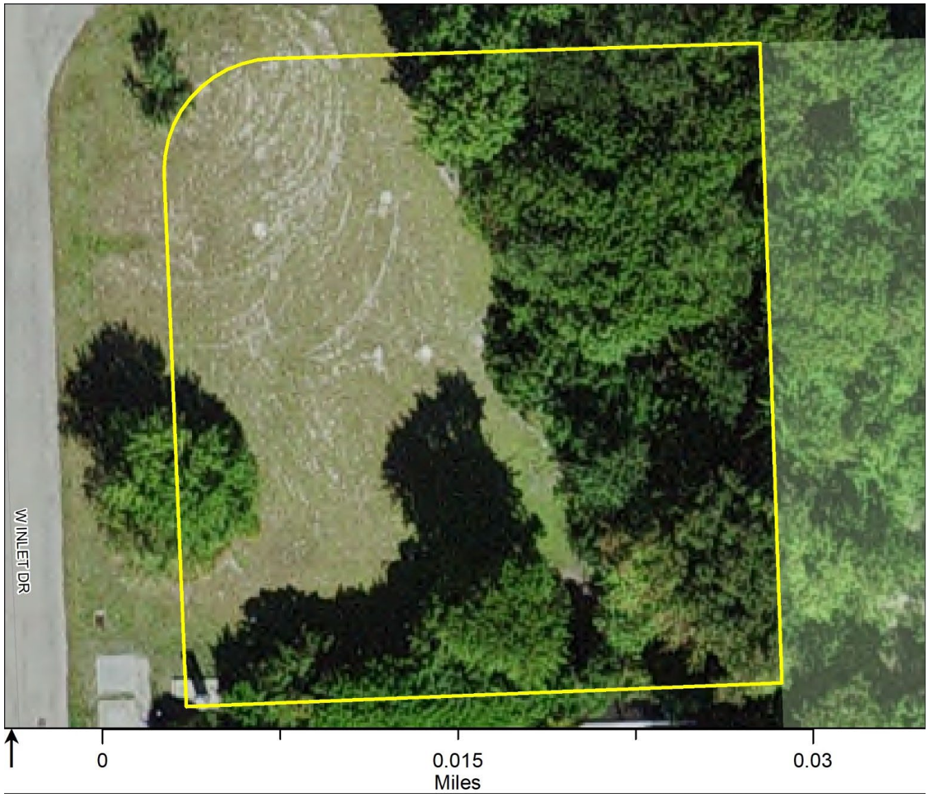
Figure 2: Khoury Aerial Map