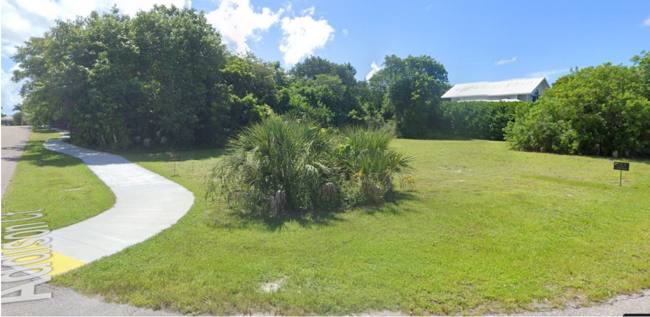
View of property looking southeast