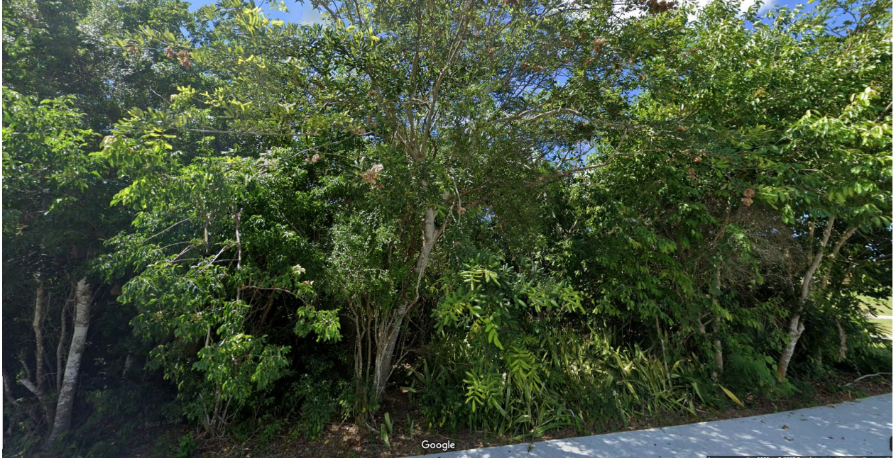
View of property looking southwest