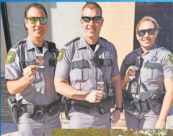
North Naples deputies visited Chick-fil-A recently to remind patrons to hide their valuables, lock their vehicles, and remove their keys/fobs.