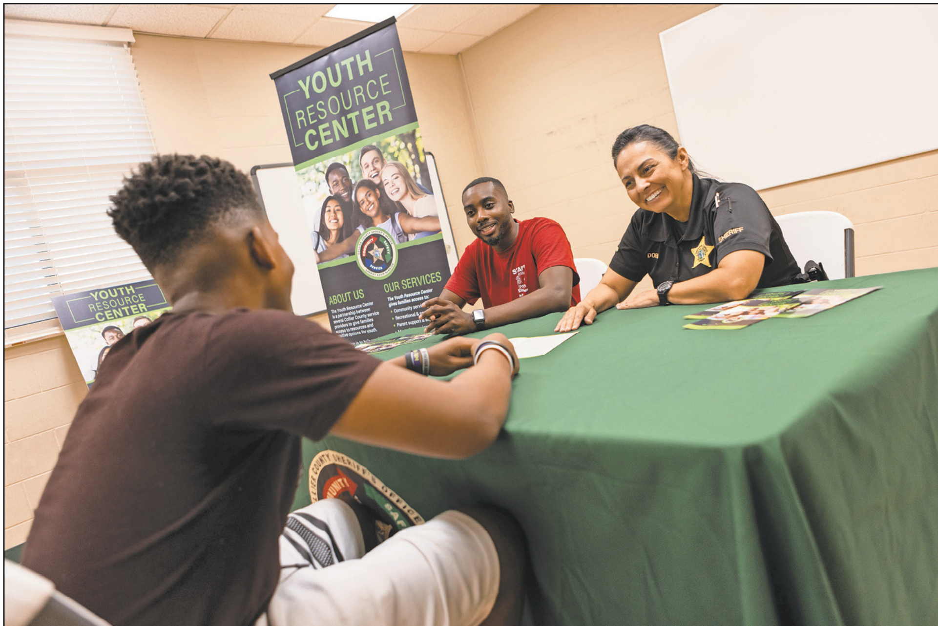
Through the Collier County Youth Resource Center, families have access to mentoring services, counseling, assessments, recreational and sporting activities, and much more.

Two new satellite locations are delivering more community engagement and access than ever to the Collier County Youth Resource Center.