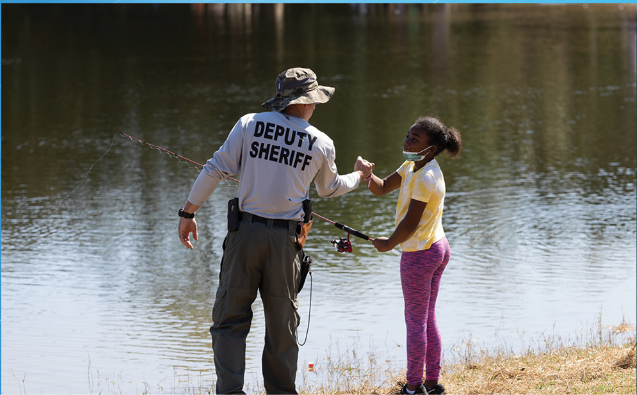
The Collier County Junior Deputies League hosted its 14th annual "Kids Love Fishing" event Feb. 12 at Florida Sports Park. Kids of all ages used cane poles to fish while spending quality time with CCSO Youth Relations Bureau deputies.