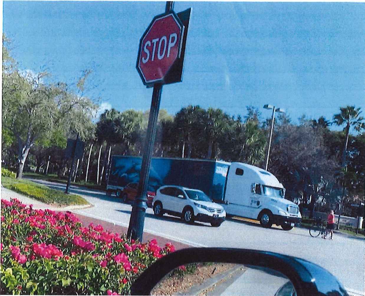
Sent from my iPhone